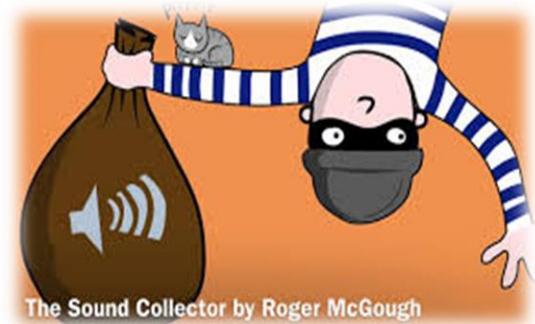
The Sound Collector by Roger McGough

Today's comprehension is a poem called The Sound Collector by Roger McGough.