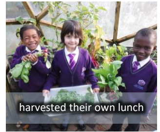
harvested their own lunch