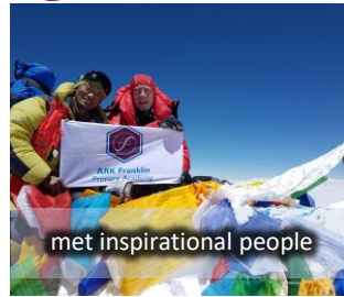
met inspirational people