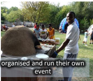
organised and run their own event