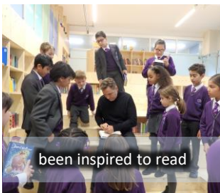
been inspired to read