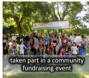
taken part in a community fundraising event