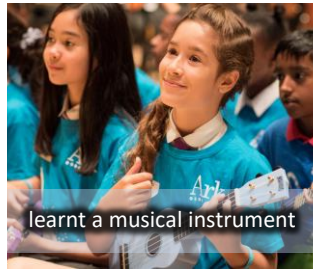
learnt a musical instrument