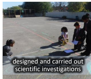
designed and carried out scientific investigations