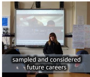
sampled and considered future careers