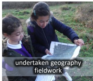
undertaken geography fieldwork