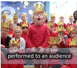
performed to an audience