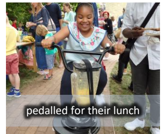
pedalled for their lunch