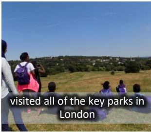
visited all of the key parks in London