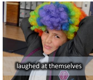
laughed at themselves