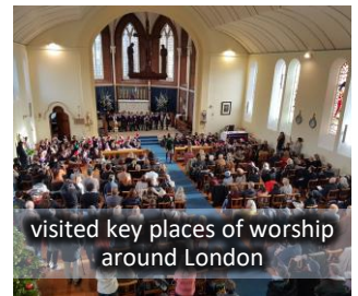
visited key places of worship around London