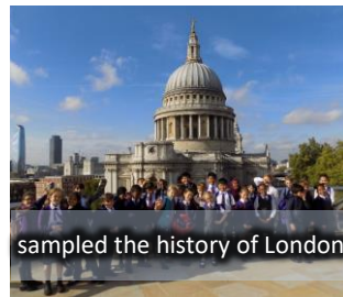
sampled the history of London