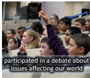
participated in a debate about issues affecting our world