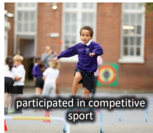
participated in competitive sport