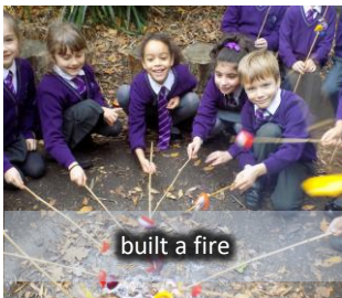
built a fire