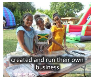
created and run their own business