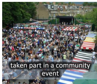
taken part in a community event