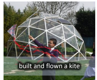
built and flown a kite