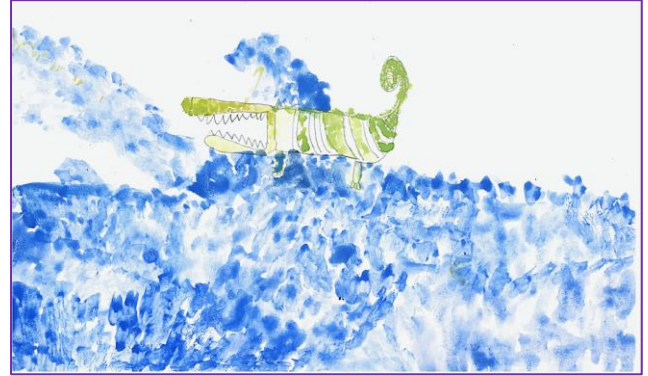
A Wolf, by Tiggy: