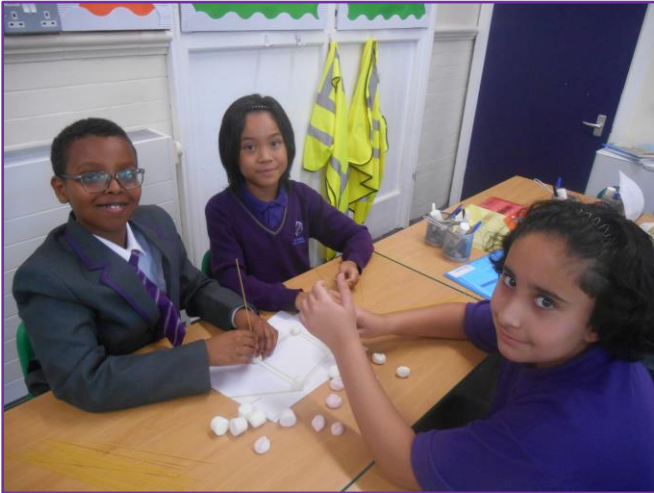
Year 6 team-building and problem-solving