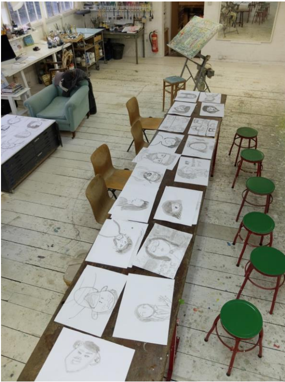
Y 5/6 at work in Tim Braden's studio