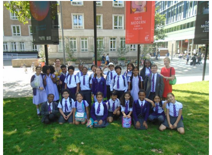
Franklin has been recognised by the Mayor of London as an exceptional school for the progress made by our pupils in 2017 and invited to join the Mayor's Schools for Success programme: well done to staff and children.