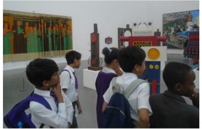
Deakin class enjoyed their visit to the Tate Modern yesterday.