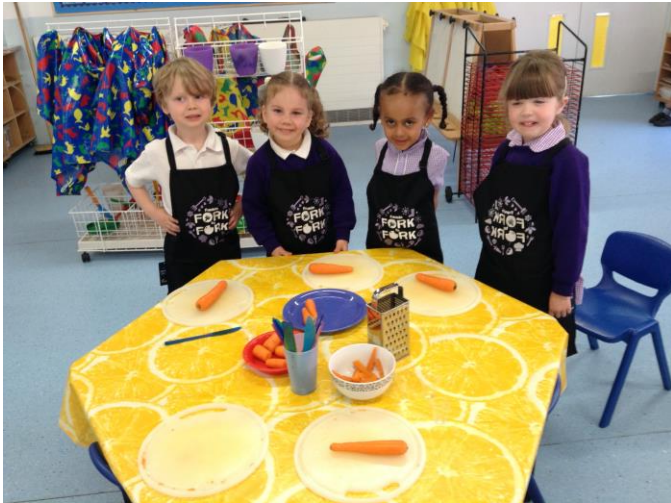
Flavour School in the nursery

As you can see from the photographs below the nursery have been enjoying Flavour School this week.